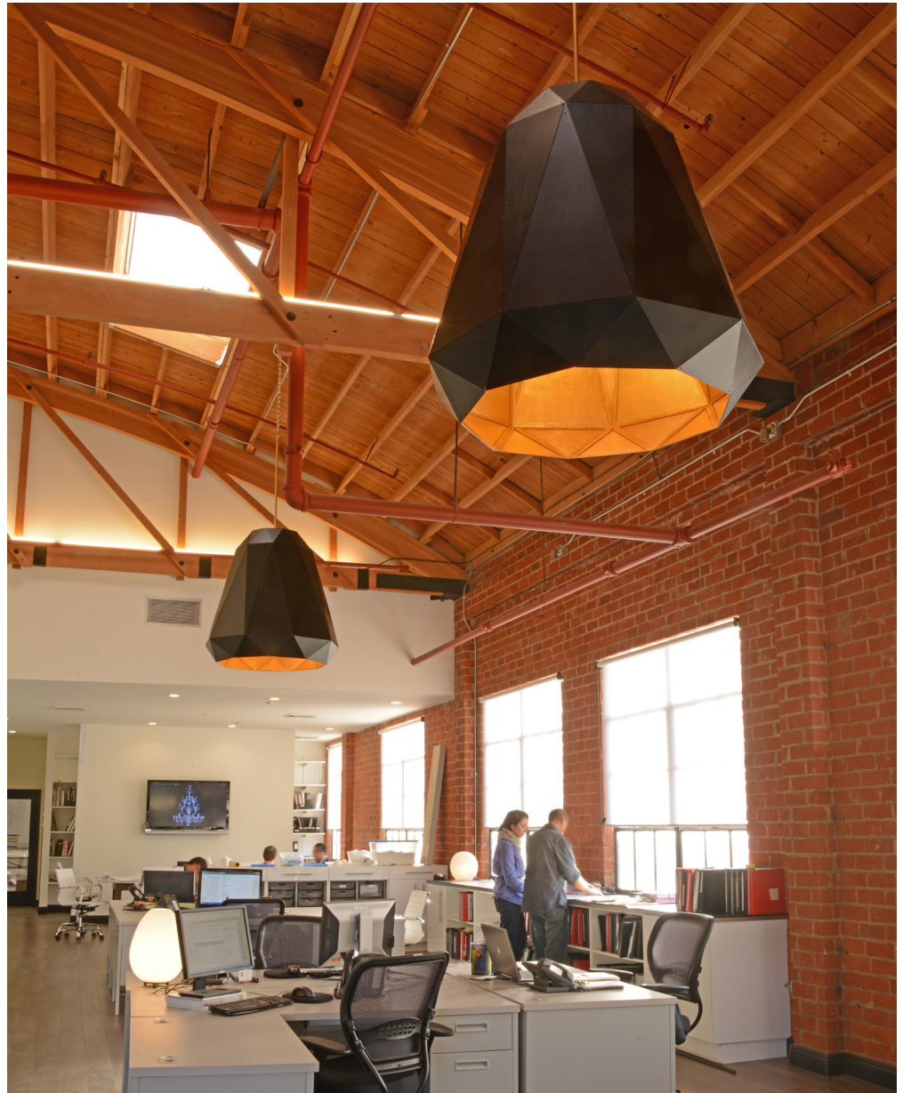
Lusive Work Space, Los Angeles, CA

By traveling the world with open eyes and open minds in search of inspiration, fresh ideas and creative possibilities, we offer our design collaborators an exclusive creative experience.