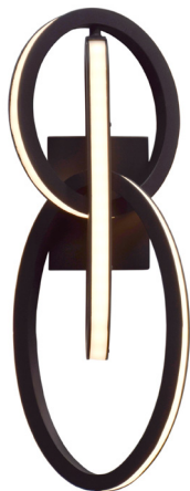
Custom Chain Link Sconce

At +60,000 sq ft and over 1,500 rooms, the new Virgin Hotel needed lighting solutions for every single space. A variety of sconces and ceiling flush fixtures were imagined, specified, created and delivered. These are just a few of our favorites from the collection.