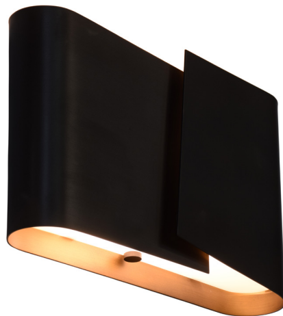
Custom Fold-Over Sconce

I like my shapes like I like my vacations... never-ending!