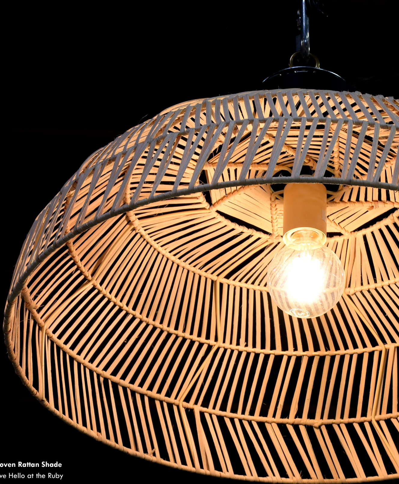
Custom Woven Rattan Shade Come weave Hello at the Ruby Tower Penthouse!