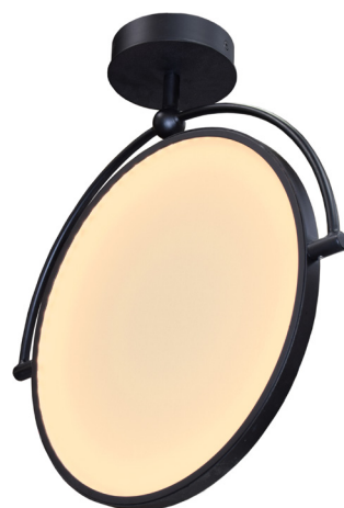
Custom Poly Round Fixture