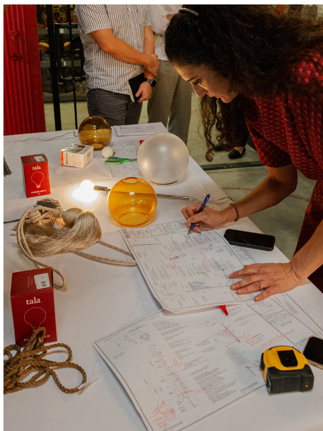
Lusive Design Studio, Los Angeles, CA

By refining the creative process, consistently building our knowledge of distinctive materials, techniques and our network of specialized artisans, the Lusive team brings unique perspectives and energy together to form a singular vision.