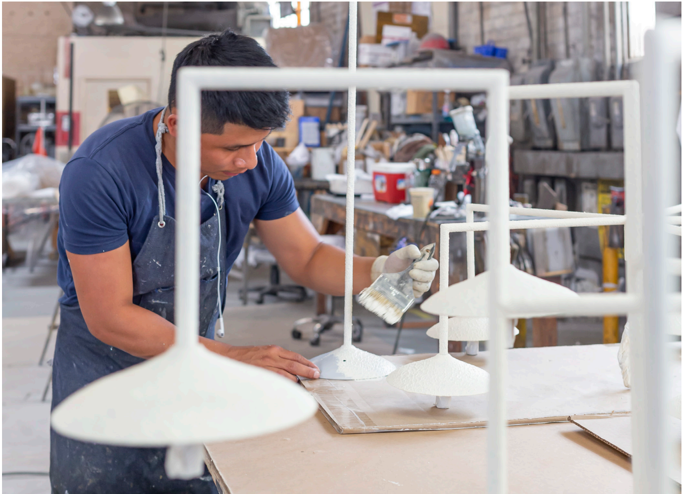
Hand Finish Paint Station at Lusive Warehouse, Los Angeles, CA

Design and manufacturing efforts are headquartered at the Lusive Decor factory and offices in Los Angeles. With an 85,000 sq ft, UL Certified facility and more than 60 employees, Lusive has designed, manufactured and shipped custom lighting fixtures to nearly every state in the union and more than two dozen foreign countries and overseas clients.