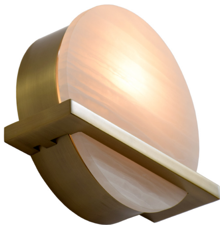
Custom Sunset Sconce

Let's overlap stories in Richard's Flat!