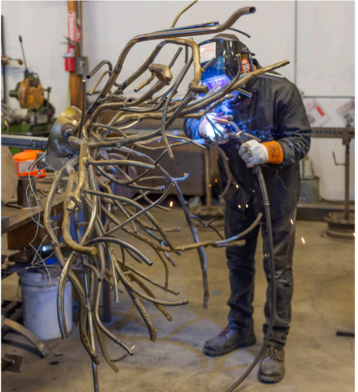
Weld Station at Lusive Manufacturing Warehouse, Los Angeles, CA