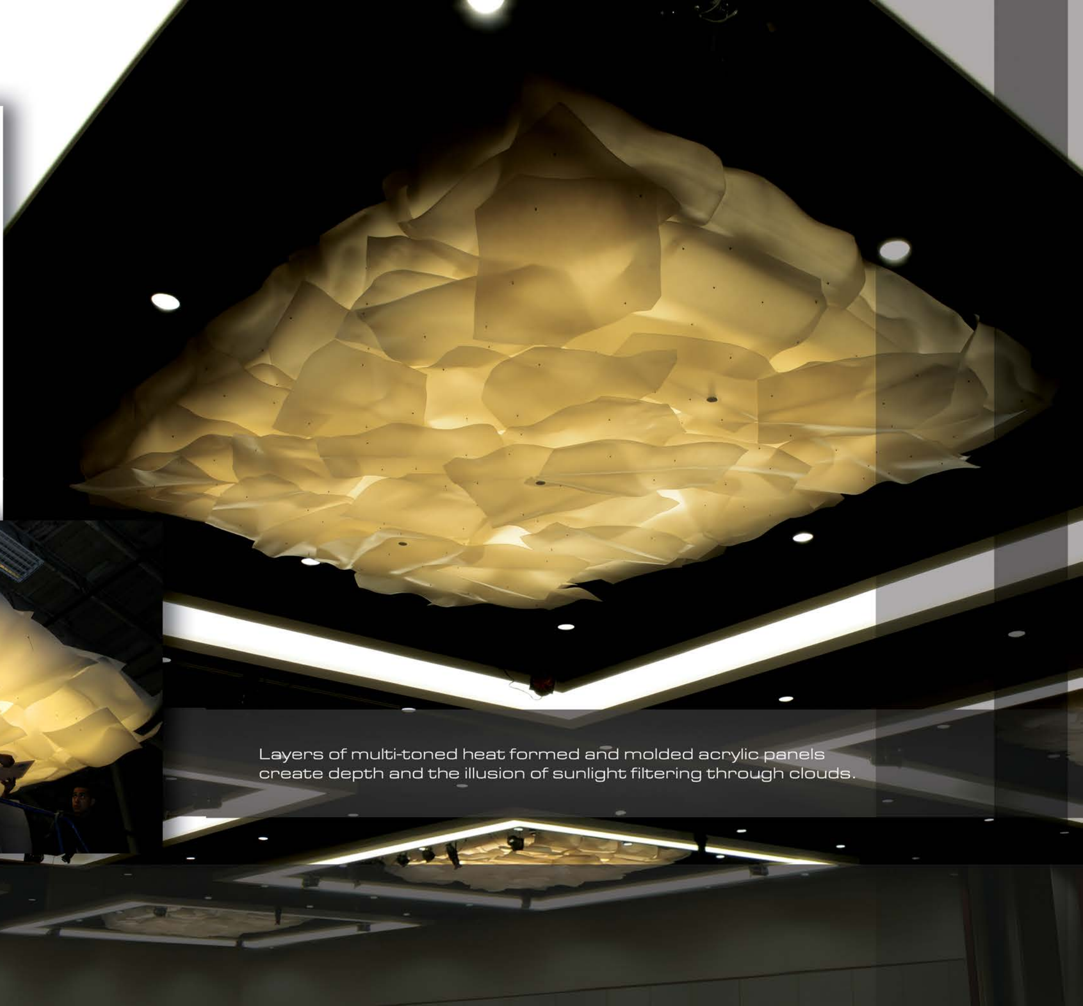
Layers of multi-toned heat formed and molded acrylic panels create depth and the illusion of sunlight filtering through clouds.

Lusive created a modular 'origami' style pattern of panels to maintain a natural look and assist the installation team.